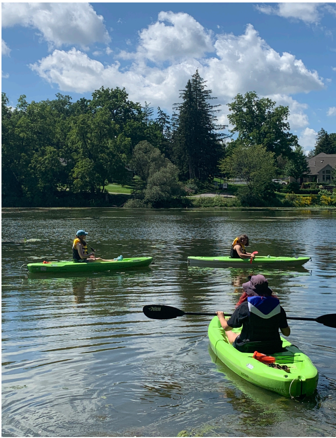
Kayaks borrowed from St. Marys Public Library