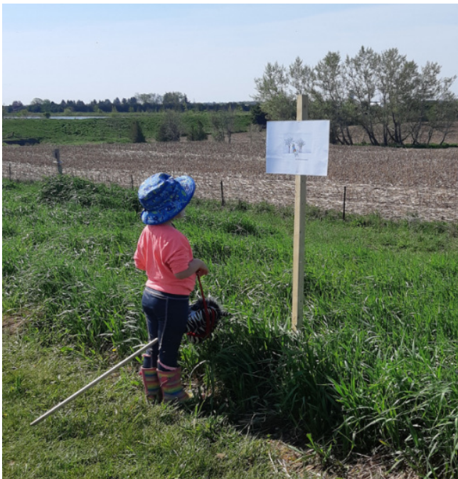
Story Walk with West Perth Public Library

over 10,000 vaccination receipts were printed for members of our community